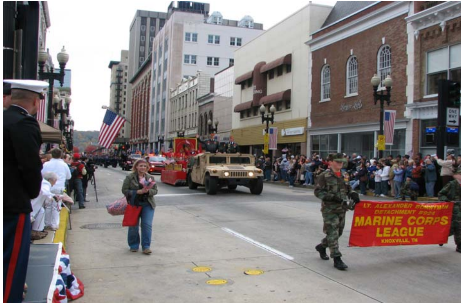
Young Marines carry the banner in front the Reserves' Humvee pulling the Detachment float in the 2009 Knoxville Veterans Day Parade.