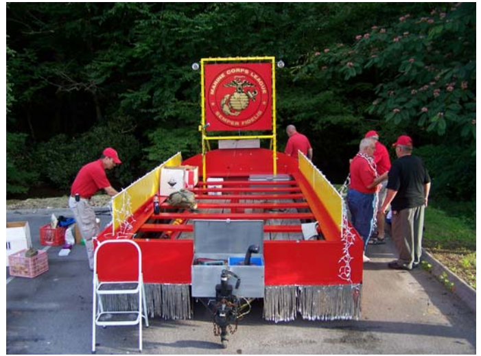
Members of the Detachment and Auxiliary prepare the Detachment float for the 2009 Gatlinburg 4th of July parade. By the time they finished, its lights and music rivaled any of the professionally prepared floats in the parade.