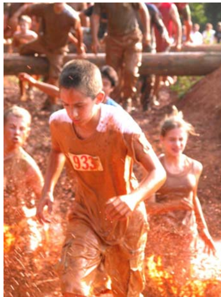
Runners in the big mud pit during the 2008 race.

so please sign up to help at the 28 July Detachment meeting. Help us have another successful and profitable Marine Mud Run.