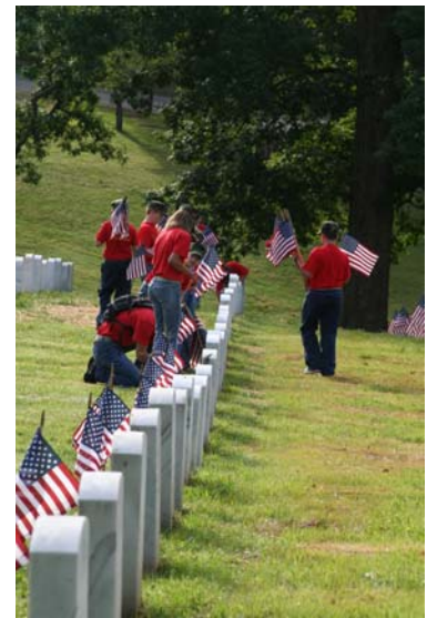
Young Marines put out flags at the state veterans cemetery before Memorial Day 2009.