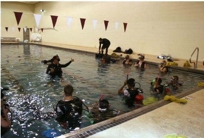
Young Marines receive instruction on SCUBA diving at the Maryville College pool.