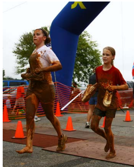
You don't want to finish without your shoes ...