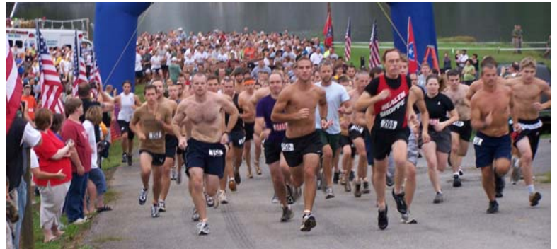
And the first wave of runners is off ...