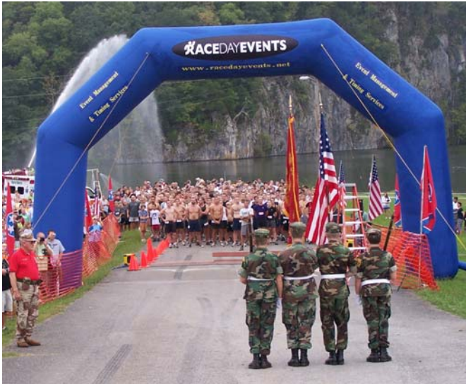
Young Marines present the colors before the start of the 2009 Marine Mud Run.