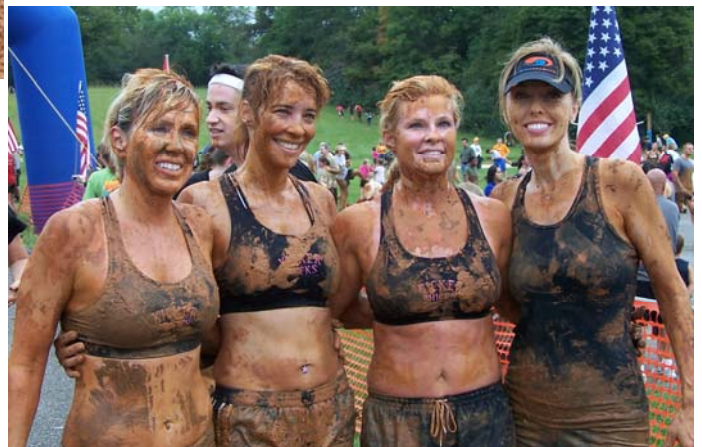
I guess these ladies won't need their spa mud bath treatment this week ...