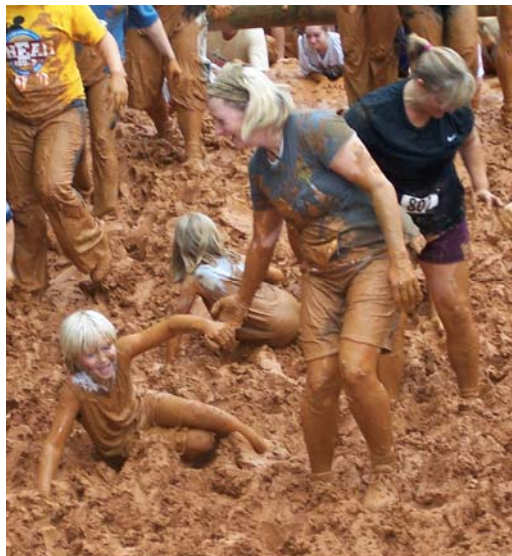
Did I mention we had plenty of mud?