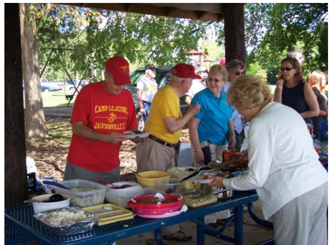
Participants helping themselves to food at the annual picnic.