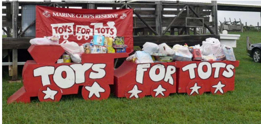
A few of the toys collected at the 2009 Marine Mud Run for Toys for Tots.