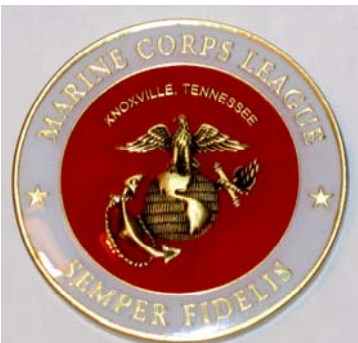
Back of Detachment Challenge Coin