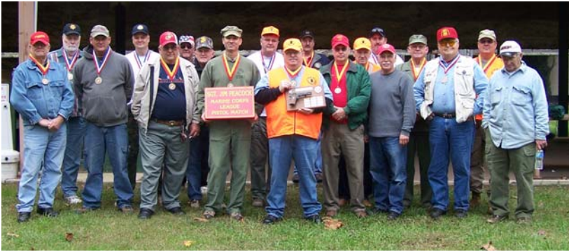
Shooters at 4th Annual Jim Peacock Pistol Match.