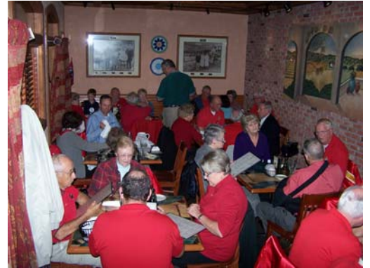
Diners are 2009 Detachment Birthday Dinner at Carrabba's Italian Grill.