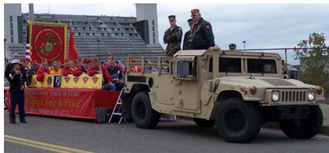
Detachment float loaded and ready to go for the 2009 Knoxville Veterans Day Parade.