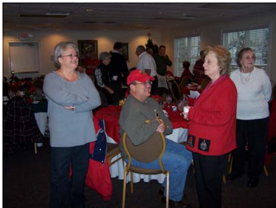
Waiting for the Christmas Breakfast to begin.