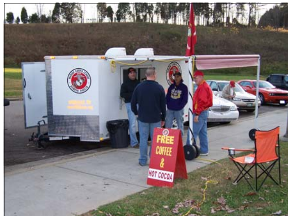
Thanksgiving weekend I-40 Safety Break duty.