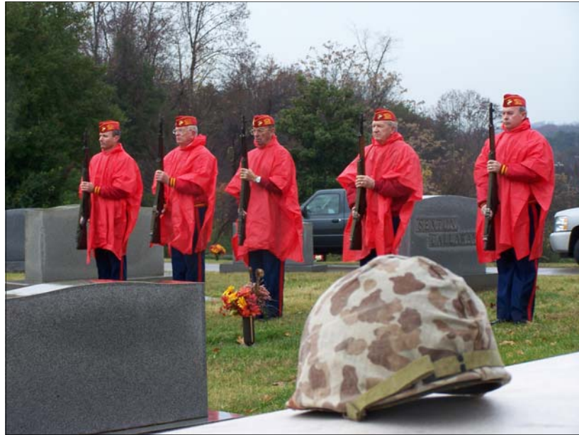
Detachment Honor Guard at Bonnyman Memorial Service - Nov. 2009.