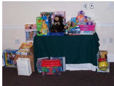
Toys donated for the Reserves' Toys for Tots Program at Detachment Breakfast Party.

the good food, including our favorite Marine Corps dish - SOS. I'm not sure the "ground beef"